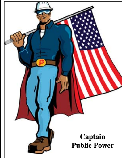
Captain Public Power

Public Power is a national, annual event sponsored in conjunction with the American Public Power Association (APPA) in Washington, D.C. APPA is the service organization for community and state-owned electric utilities.